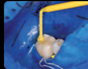
5. Insertion of the restoration