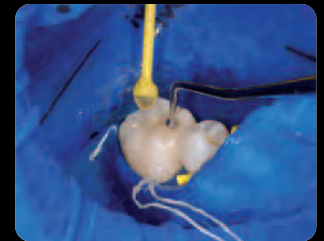
6. Removal of OptraStick using a hand instrument