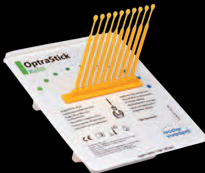
OptraStick Refill / 50 pieces