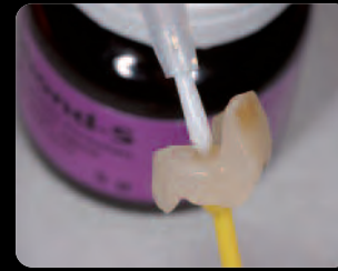
3. Silanization with Monobond-S