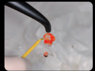
2. Removal of IPS Ceramic Etching Gel with water spray