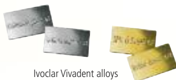
Ivoclar Vivadent alloys