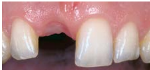
Large picture: An esthetically pleasing alternative – an IPS d.SIGN bridge