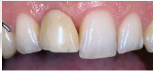
Small picture bottom: Without clasp denture